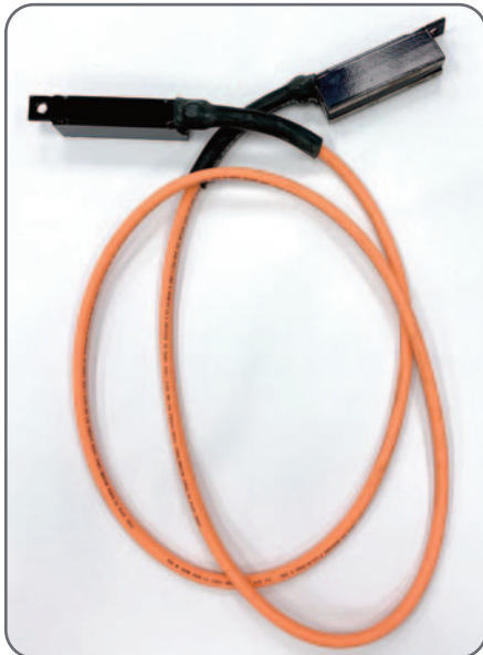
Standard Magnetic Ends