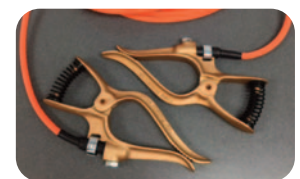
Spring Clamp Ends Available

Please contact your local distributor with questions or for more information